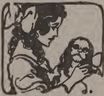
She Was Devoted to Chung Wang.

J ACK and Evelyn had met the smallest dog they had ever seen that afternoon. Of course when daddy came home they told him about it.